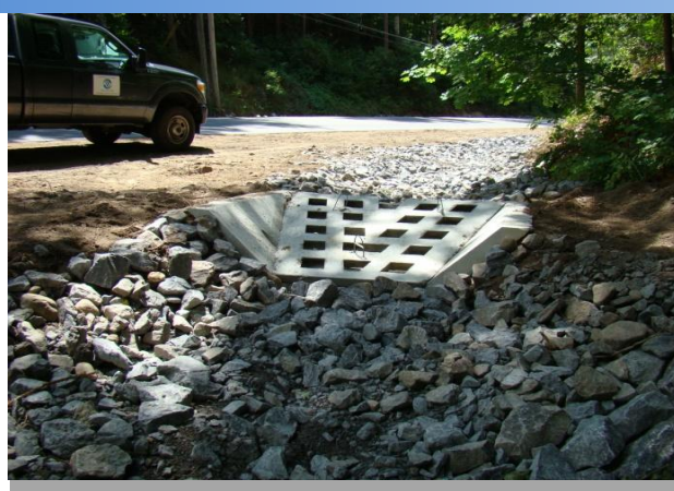
Sediment basins help to reduce the amount of sediments that enter our water sources. This one was installed in the summer of 2016 (top), and was tested out in some spring thawing February 2017 (bottom)!

Roadside erosion control measures were also a big part of our 2016 activities. Over 10 acres of roadsides were hydroseeded utilizing our WQIP grant funding. We were also able to assist our towns with more severe problems. Our biggest project was on the Golf Course Road in the Town of Black Brook. 600 feet of highly eroding ditches were lined with rip rap, one pre-cast sediment basin was installed, numerous check dams were installed and the roadsides were hydroseeded to prevent sediment runoff. The District also hosted a 4-hour Erosion & Sediment Control workshop early in the year, with over 20 attendees learning how to implement erosion control measures for better construction site management.